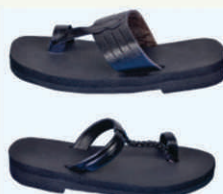
M.C.R Footwear Regular (Female)