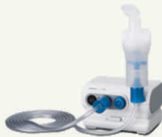
Omron Ne-C30 Compressor Nebulizer