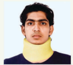
Cervical Collar Full Foam