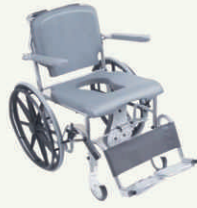
Shower Wheelchair Sas100