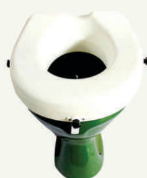
Raised Toilet Seat With Clamp 8cm With Bag