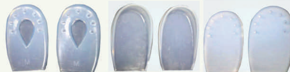
Silicone Calcaneal Spur Pad