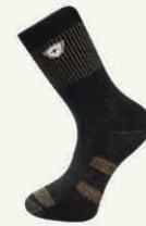
Silver Guard Socks (Diabetic Socks)