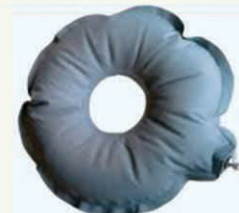
Water Coccyx Wedge Seat