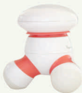
Healthline Mini Massager Mm03