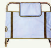
Adjustable Back Rest