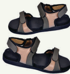
Mcr Footwear Dunmark (Reverse Buckle)