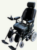
Powered Reclining Wheelchair (Kke)