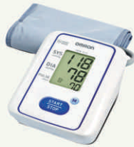
Omron Hem-7113 Blood Pressure Monitor