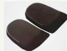
M.C.R. Heel Support