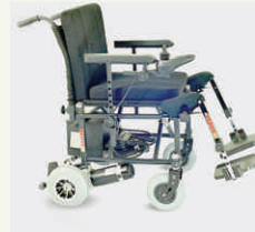
Verve Fx Portable Folding Powered Wheel Chair