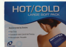
Hot And Cold Gel Pack Large