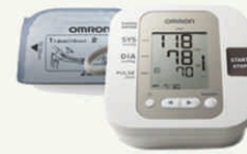
Omron Jpn1 Hem-7200 Blood Pressure Monitor