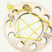
Let's Lace On Ring