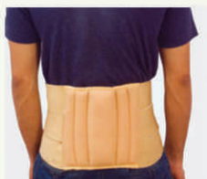
Lumbo Sacral Belt Eco Frame