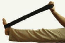
Leg Lifter Belt