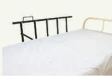
Bed Side Rail