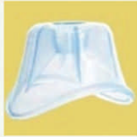
Eye Drop Guide