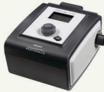
Philips Remstar Auto Cpap With A-Flex