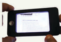
Magnifying Lens With Led