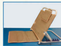
Adjustable Back Rest