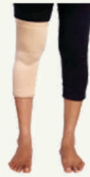
Knee Cap Long