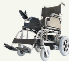
Standard Folding Power Wheelchair Kkr1