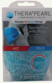
Therapearl Sports Wrap