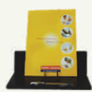
Book Holder (Mdf With Metal Pin Support)