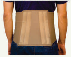
Lumbo Sacral Corset