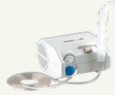
Omron Ne-C25s Nebulizer