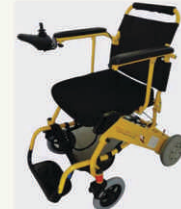
Lightweight Folding Wheelchair