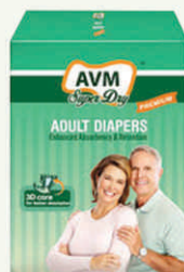
Avm Adult Diapers