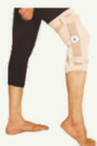
Knee Cap With Hinges