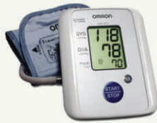
Omron Hem-8711 Blood Pressure Monitor