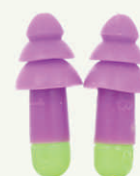
Silicone Ear Plugs