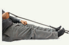
Bed Pull Up Strap