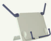
Defianz Portable Book Stand