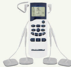
Choicemmed Electronic Pulse Stimulator