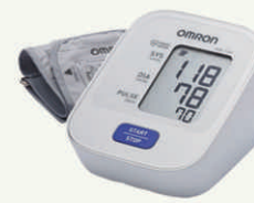
Omron Hem-7121 Blood Pressure Monitor