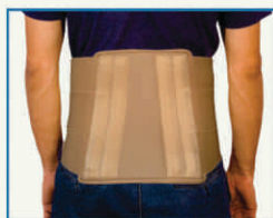
Lumbo Sacral Belt Contoured (Deluxe)