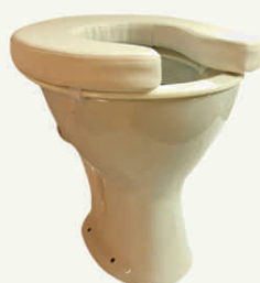
Foam Toilet Seat 5cm & 10cm