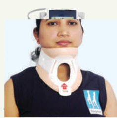
C-Phill (Philadelphia Collar)