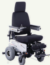
Galaxy A W A Motorised Wheelchair