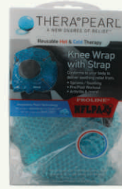
Therapearl Knee Wrap