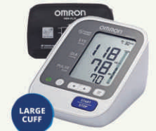
Omron Hem-7130-L Blood Pressure Monitor