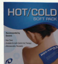
Hot And Cold Gel Pack Small