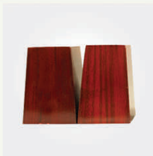
Chair/Bed Raiser 14 Cm