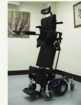
Stand Up Wheel Chair