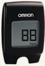
Omron Hgm-112 Glucometer