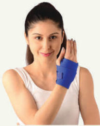
Neoprene Wrist Brace