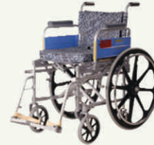
Vissco Manual Wheelchair