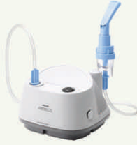
Innospire Elegance Compressor Nebulizer