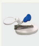
Nail Clipper With Magnifying Lens