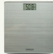
Omron Hn-286 Digital Weighing Scale