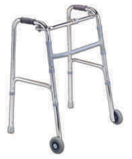
Walker With Casters