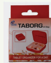
Tablet Organiser A Day