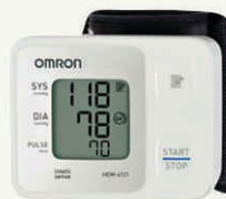
Omron Hem-6121 Wrist Blood Pressure Monitor