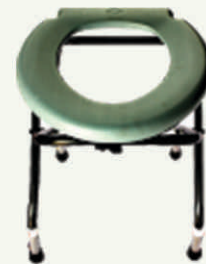
Adjustable Indian Commode