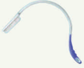
Curved Bath Brush