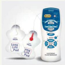
Omron Hv-F127 Pulse Massager