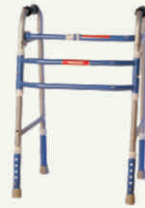
Vissco Folding Walker