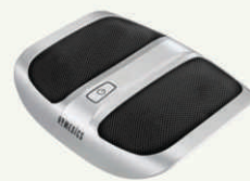
Homedics Foot Massager