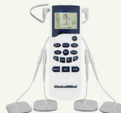
Choicemed Electronic Pulse Massager