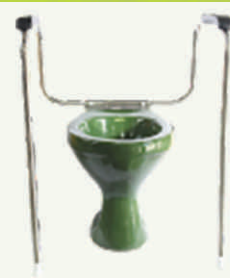
Toilet Safety Rail Stainless Steel