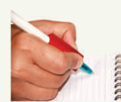
Pencil and Pen grip