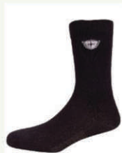
Silver Everyday Socks (Office Use)