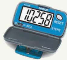
Omron Hj-005 Pedometer