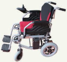
Powered Folding Wheelchair