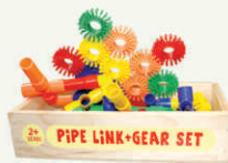
Link Pipe & Gear