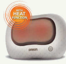
Omron Cushion Massager Hm-340