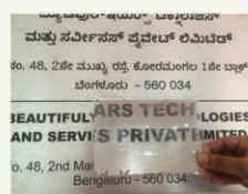
Dolphin Magnifier Sheet (Fresnel Lens)