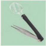
Tweezers With Magnifier