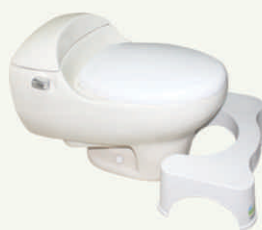
Squatty Potty Stool