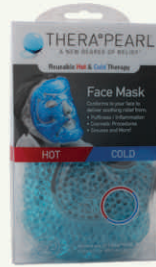
Therapearl Face Mask