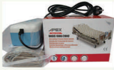
Pressure Relief Bubble Mattress