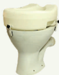
Raised Toilet Seat With Clamps 13cm With Bag