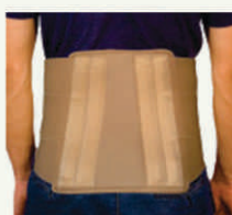
Lumbo Sacral Belt Regular