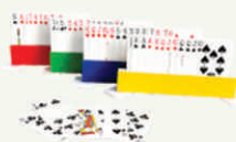
Playing Card Holder