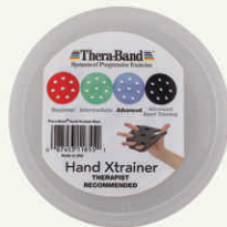
Hand Xtrainer Theraband