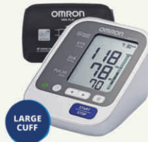
Omron Hem-7132 Blood Pressure Monitor