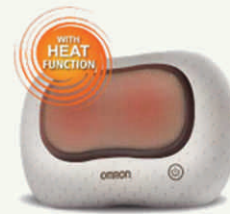
Omron Cushion Massager Hm-300