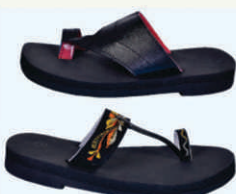
M.C.R Footwear Deluxe (Female)