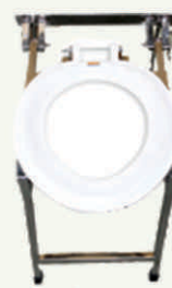
Indian Conversion Commode Stainless Steel