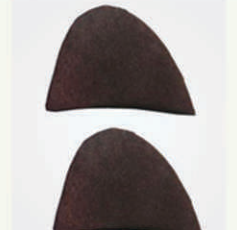
M.C.R. Arch Support