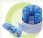
Tablet Organiser Thrice A Day