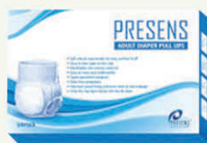
Presens Adult Diaper Pull-Ups