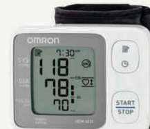
Omron Hem-6131 Wrist Blood Pressure Monitor