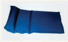
Water Bed For Bed Sore Prevention