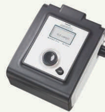
Philips Remstar Bipap Auto With Bi-Flex