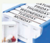
Tablet Organiser Four Times A Day