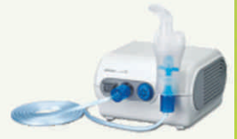
Omron Ne-C28 Compressor Nebulizer