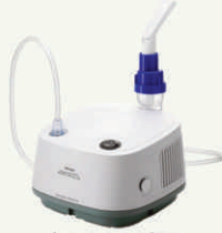
Innospire Essence Compressor Nebulizer