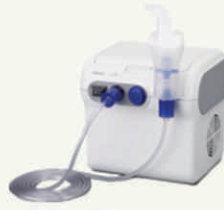
Zoom Omron Ne-C29 Nebulizer