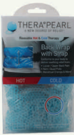
Therapearl Back Wrap