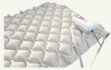
Bubble Air Mattress