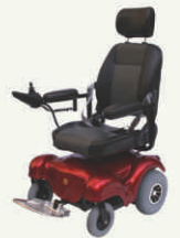
Deluxe Powered Wheelchair Kkd1