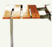
Folding Shower Seat