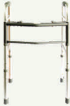
2 Button Folding Walker