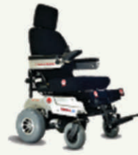
Tetra Exi All-Terrain Powered Wheelchair