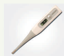
Mc-343 Thermometer (Pencil Type)