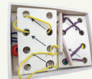
Let's Lace On Plates