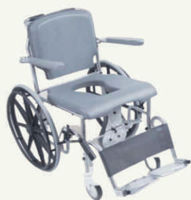
Shower Wheelchair Sas100