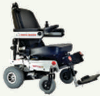
Tetra Ex Powered Wheelchair