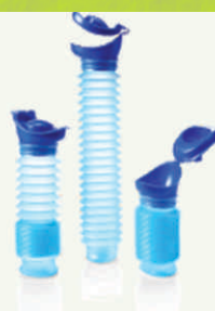
Uriwell Unisex Urinal