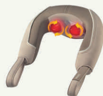
Homedics Shiatsu Neck Massager