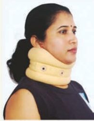
Soft Cervical Collar