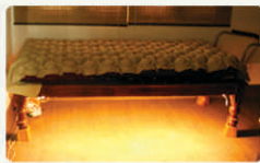
Mylight Bedlight Motion Sensor Lights