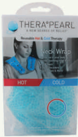
Therapearl Neck Wrap