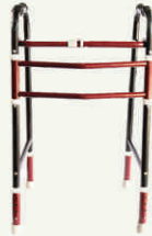
Walker Plain Ms