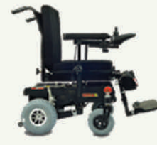
Tetra T15 Rigid Frame Powered Wheelchair