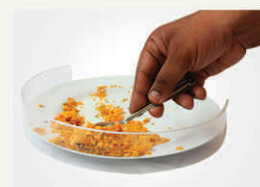
Food Bumper (Big & Small)