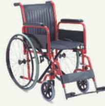
Manual Wheelchair Kkm2