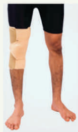
Knee Brace (Short)