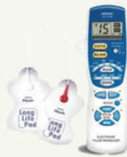
Omron Hv-F128 Pulse Massager