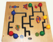
Find The Path Puzzle