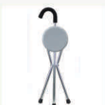
Walking Stick With Seat