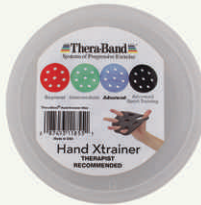
Hand Xtrainer Theraband