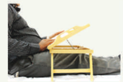
Folding Bed Tray