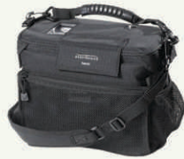
Philips Evergo Portable Oxygen Concentrator