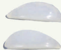
Silicone Insole With Medial Arch