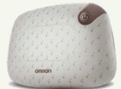
Omron Cushion Massager Hm-300