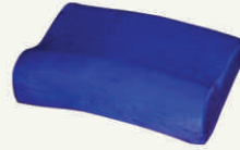
Cervical Orthopedic Pillow