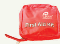
First Aid Kit Bag