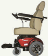
Customised Deluxe Wheelchair Kkd 02