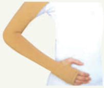
Compression Arm Sleeve

Neck, Shoulder, Back, Arms, Elbows, Wrist & Fingers