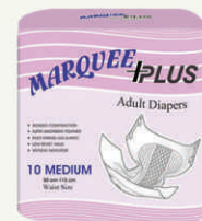
Marquee Plus Adult Diapers