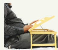
Folding Bed Tray