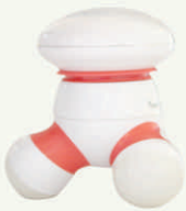
Healthline Mini Massager Mm03