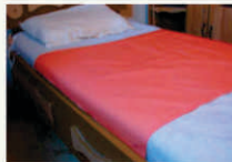
Mackintosh Rubber Sheet