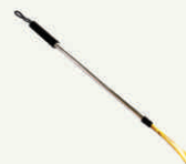
Shoe Horn (Large)