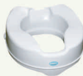
Raised Toilet Seat 10 Cm