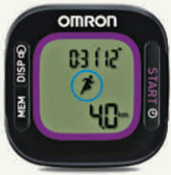
Omron Hja-313 Pedometer