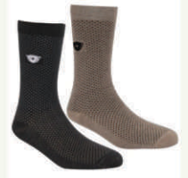
Silver All Day Socks (Pair)