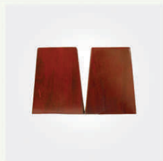
Chair/Bed Raiser 12.5 Cm