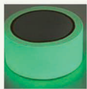
Glow In The Dark Tape 1" X 10 Ft