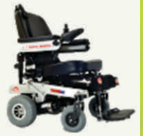
Verve Rx Rigid Frame Powered Wheelchair