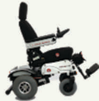
Pristine Flex Outdoor Electric Wheel Chair