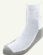
Silver Ankle Socks