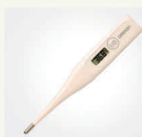
Mc-246 Thermometer (Pencil Type)