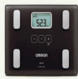
Omron Hbf-212 Body Composition Monitor