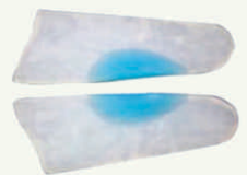
Silicone Medial Arch