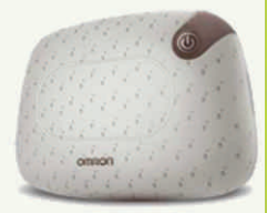
Omron Cushion Massager Hm-300