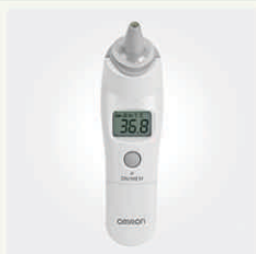
Th-839s Thermometer (Ear)