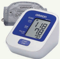
Omron Hem-8712 Blood Pressure Monitor