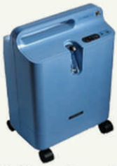
Philips Everflo Oxygen Concentrator