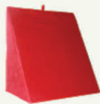
Bed Comfort Wedge