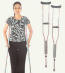
Adjustable Aluminium Crutches (Pair)