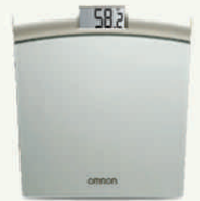
Omron Hn-283 Digital Weighing Scale