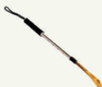
Shoe Horn (Medium)