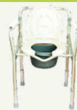
Aluminium Folding Commode