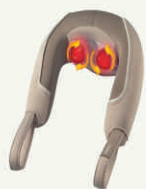
Homedics Shiatsu Neck Massager