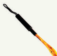
Shoe Horn (Small)