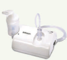
Omron Ne-C801 Compressor Nebulizer