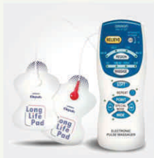
Omron Hv-F127 Pulse Massager