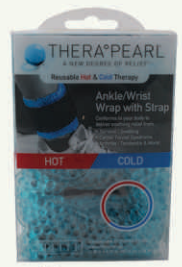
Therapearl Ankle Wrist Wrap With Strap