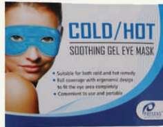
Gel Eye Mask