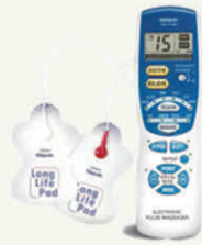
Omron Hv-F128 Pulse Massager