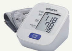
Omron Hem-7120 Blood Pressure Monitor