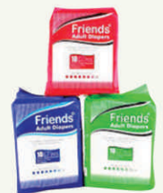
Friends Adult Diapers