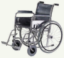
Standard Folding Manual Wheelchair Kkm1