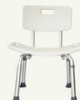
Shower Chair With Back Rest