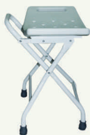
Foldable Shower Bench