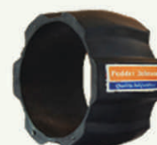
Door Knob Gripper