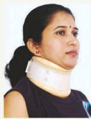
Hard Cervical Collar