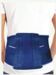
Lumbo Sacral Belt Blue (Double Strapping)