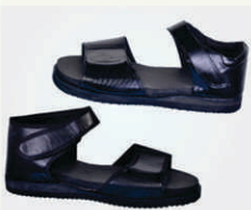
M.C.R Footwear Dunmark