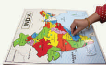
India Map Puzzle