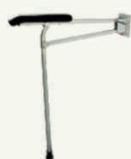
Folding Aluminium Arm Support