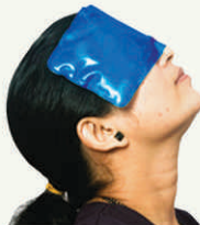
Hot And Cold Pack