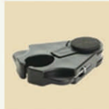
Walking Stick Clip